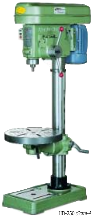
HD-250 (Semi-Automatic) HDT-25 (Tapping) HDT-32 (Tapping)