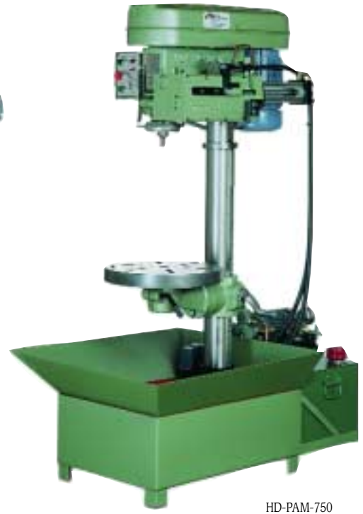
HD-PAM-750 (Base Optional)